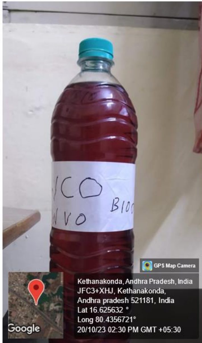
Waste Cooking Oil Biodiesel (B100)

Kethanakonda (V), Ibrahimpatnam (M), Vijayawada, AMARAVATI-521456.